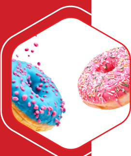
AROMA VE RENKLENDİRİCİLER FLAVOURS AND COLORING