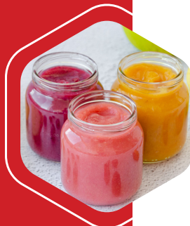
MEYVELİ SOS FRUIT SAUCE