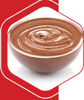
ÇİKOLATA SOSU CHOCOLATE SAUCE