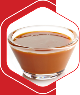
KARAMEL SOSU CARAMEL SAUCE