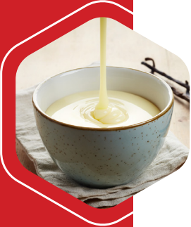
VANİLYA SOSU VANILLA SAUCE